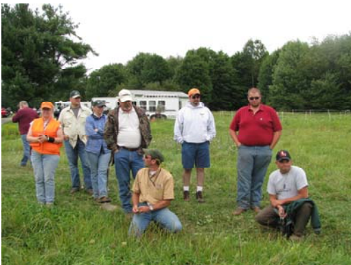
Watching AWGD Call Backs